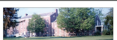
Shepherd Home, Middletown

Give the precious gift of a home this holiday season. You can donate the cost of a temporary home while people get back on their feet or a deposit on an apartment so they may live independently while adjusting to the workforce and their community. So, give the gift of housing in someone's honor and we will send your honoree a card notifying them of your thoughtful gesture. Place your order using the form in this catalog.